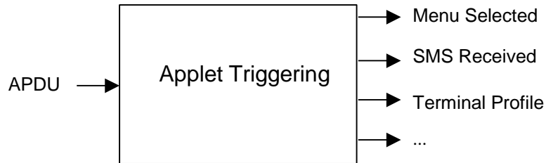
Figure 3: toolkit applet triggering diagram

The application triggering portion of the SIM Toolkit Framework is responsible for the activation of toolkit applets, based on the APDU received by the GSM application.