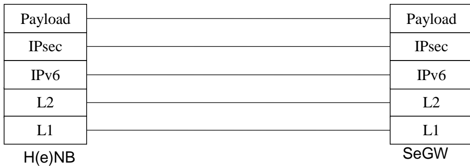
Figure 4.1.2-2: User Plane for H(e)NB - SeGW Interface over IPv6 transport network