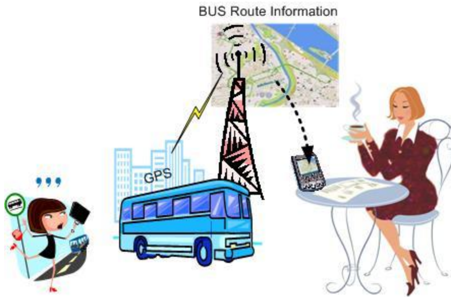
Figure 3 Use Case for Public Transport Information Service