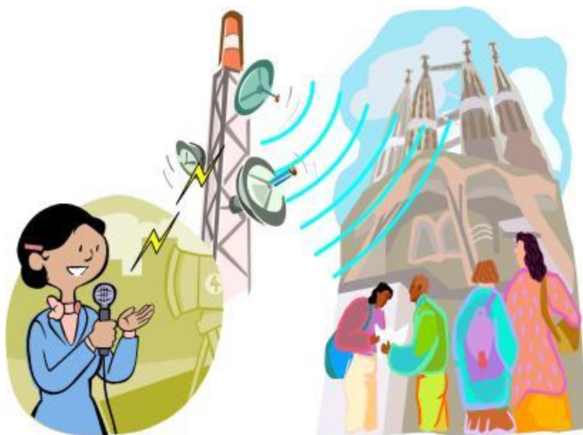
Figure 2 Use Case for Guided Tour

For example in a guided tour, a tourist guide use mobile device for speaking group of tourists instead of using noisy amplifier. Streaming audio[9][10] as well as multimedia information, electronic tickets for entering tourist sites can be distributed. The location information of the tourist guide is constantly broadcast that the tourists may keep track of the guide when they are spread in large area. Paging capability of the mobile PBCP is an important function to support because the tourist guide needs to reassemble the group and move to another location. Interactive communication between the mobile PBCP and users also need to be supported.