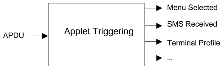
Figure 3: toolkit applet triggering diagram

The application triggering portion of the SIM Toolkit Framework is responsible for the activation of toolkit applets, based on the APDU received by the GSM application.